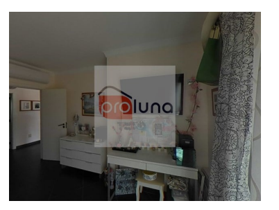
= 5 Bedrooms